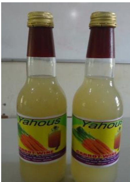
Figure 2 Bottled carrot wine after 60 days fermentation Adjudged as physically appealing and smooth taste feel.

consistent smooth feeling (authors' opinion only) and could be modeled with yeast dynamics.